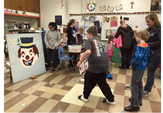
FUN FAIR: The OLOL eighth-grade class of 2017 organized and oversaw a Fun Fair to raise money for their class gift to the school during the March 12 Fish Fry. The younger kids played the games for donated prizes. The Fun Fair was an inspired addition to the weekly Fish Fry. Eighth-grade parents also sold desserts during the Fish Fry to benefit the class.

REGIONAL CHAMPIONS: The seventh-grade girls volleyball team won its IESA Class 1A Regional as the No. 4 seed. The Lancers beat Holy Family in the semi-finals and Springfield Aloysius for the title at Springfield Little Flower on Feb. 28. At sectionals on March 6, the Lancers were defeated in three tough games by Jacksonville Our Saviour.